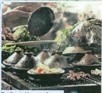
Rustle up a Moroccan feast