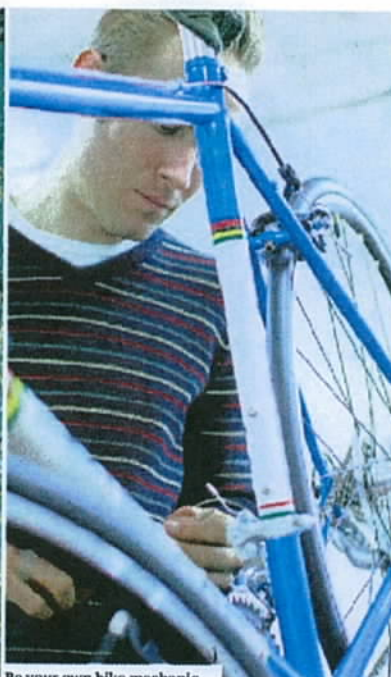
Be your own bike mechanic

● £85, including accommodation and some meals; next course 22 January (01479 831331, scotmountain.co.uk)